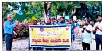
ಭಾಗವಹಿಸಿ ಮತದಾನ ನಮ್ಮ ಹಕ್ಕು ಕಡ್ಡಾಯವಾಗಿ ಮತ ಚಲಾಯಿಸಿ, ನಮ್ಮ ಮತದಾನ ನಾಡಿನ

ಅಭಿವೃದ್ಧಿಯೆ ಹಿತ ಎಂಬ ಘೋಷ ವಾಕ್ಯಗಳೊಂದಿಗೆ ಕಾಲೇಜಿನಿಂದ ಬಲ್ಲಾಳ್ ವೃತ್ತದ ಮೂಲಕ ಆಲ್‌ಟಿ. ವೃತ್ತ, ರಾಮಸ್ವಾಮಿ ವೃತ್ತದವರೆಗೆ ಸಾಗಿ ದ್ವಿಚಕ್ರ ಮತ್ತು ವಾಹನ ಸವಾರರಿಗೆ ಗುಲಾಬಿ ಹೂ ನೀಡುವುದರೊಂದಿಗೆ ಮತದಾನದ ಮಹತ್ವವನ್ನು ತಿಳಿಸಿ ಕಡ್ಡಾಯವಾಗಿ ಮತದಾನ ಮಾಡಲು ಪ್ರೇರಣೆ ನೀಡಲಾಯಿತು.